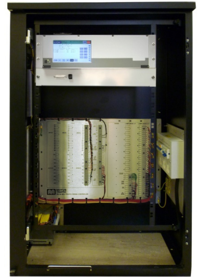
LARGE CASE 24 PHASE CONTROLLER

The TM-150-3 Traffic Controller develops what the TM-150-2 started, being a modern, flexible, and high performance traffic controller, which meets the requirements of TOPAS TR2500.